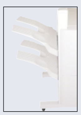
Two-Tray Finisher (AR-FN8)